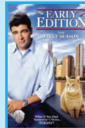
The Early Edition (1996-2000) Joliet Correctional Center