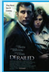
Derailed (2005) Joliet Correctional Center