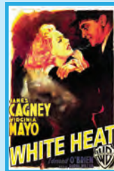
White Heat (1949) Joliet Correctional Center