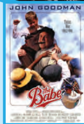
The Babe (1992) Rialto Square Theatre