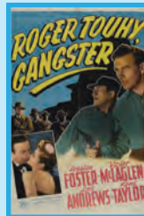
Roger Touhy, Gangster (1944) Joliet Correctional Center