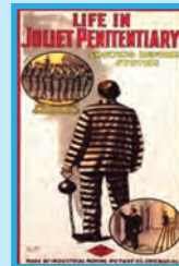
Joliet Prison (1914) Joliet Correctional Center