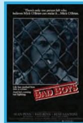
Bad Boys (1983) Joliet Correctional Center