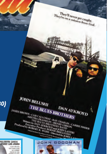
The Blues Brothers (1980) Joliet Correctional Center

Please refer to the map to find the locations, particularly the prisons, Joliet Correctional Center (1125 Collins St.), and Stateville Correctional Center (16830 S Broadway St.) and assorted spots throughout the downtown area.