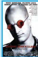
Natural Born Killers (1994) Stateville