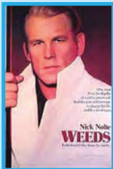
Weeds (1987) Joliet Correctional Center