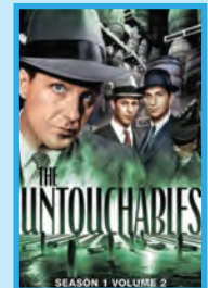
The Untouchables (1959-1963) Joliet Correctional Center

For more information, call 815-588-7940 or visit www.HeritageCorridorCVB.com