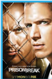
Prison Break (2005-2009) Joliet Correctional Center