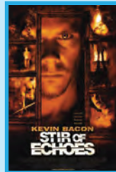
Stir of Echoes (1999) Rialto Square Theatre