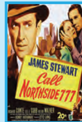
Call Northside 777 (1948) Joliet Correctional Center Stateville