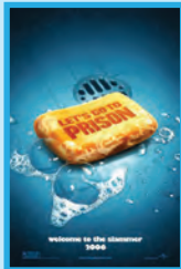
Let's Go to Prison (2006) Joliet Correctional Center