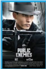
Public Enemies (2009) Joliet Correctional Center Stateville