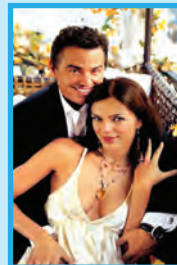
My Fair Brady (2005-2008) Rialto Square Theatre Christ Episcopal Church