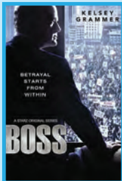
Boss (2011-2012) Joliet Diner