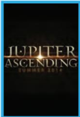
Jupiter Ascending (2014) 2001 Wildspring Parkway